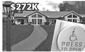
Eagle Crest Cove - 822