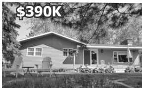
718 Bear Trap Lane