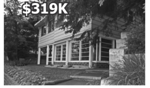
739 Cty. Rd. C