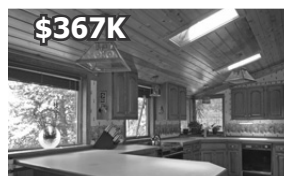
677 Bear Trap Court