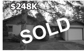
726 Cty. Rd. F