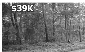
73X Bear Trap Lane