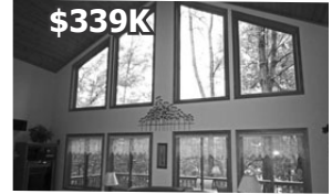
1006 Sunrise Beach Dr.