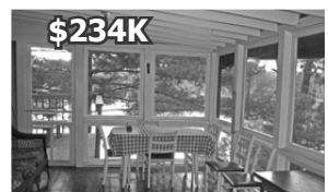
730 Bear Trap Lane