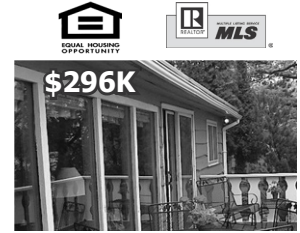
725 Hickory Point Lane