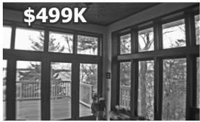
806 Flo's Court