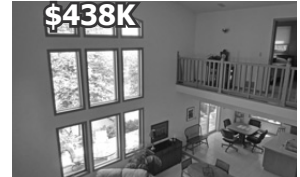
724 So. Shore Drive