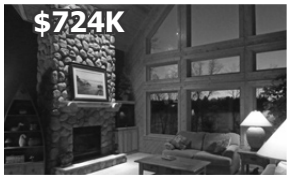
7731 Cty. Rd. C