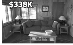
733 Cty. Rd. C