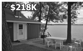
744 Cty. Rd. F