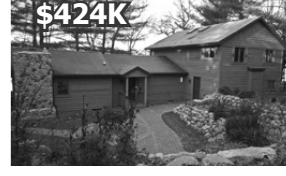
997 Lone Pine Court