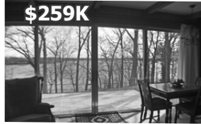
806 Flo's Court