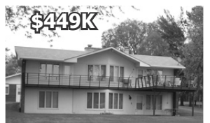
717 Cty. Rd. C