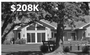
Eagle Crest Cove - 814