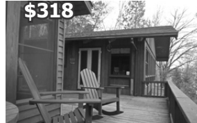
667 Bear Trap Court