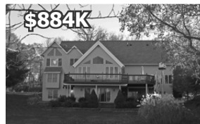
1163 Jeans Lane