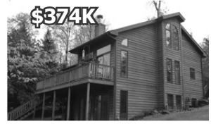
982 Sunrise Beach Dr.