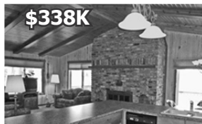
898 Sunrise Beach Dr.