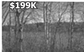
672 So. Shore Drive