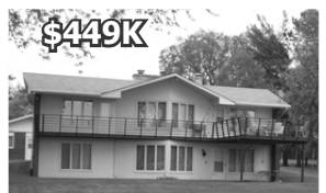
717 Cty. Rd. C