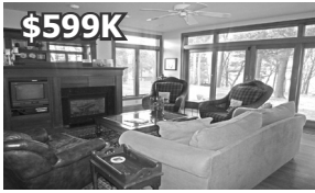
1289 So. Shore Drive