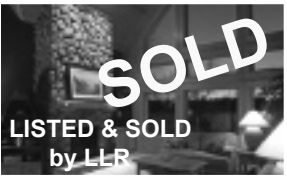
731 Cty. Rd. C