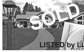
Eagle Crest Cove Townhse