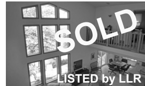
724 So. Shore Drive