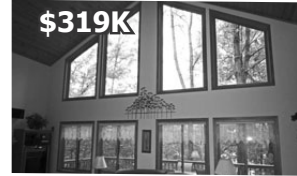
1006 Sunrise Beach