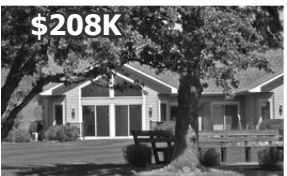
Eagle Crest Cove - 814