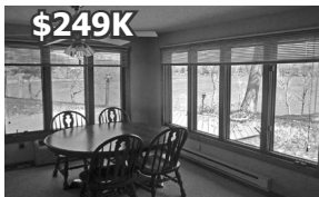
986 Sunrise Beach Dr.