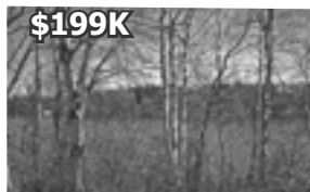
672 So. Shore Drive