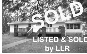
937 Wallace Drive