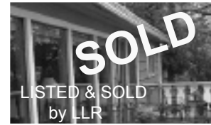
725 Hickory Point Lane