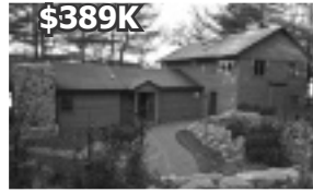
997 Lone Pine Court