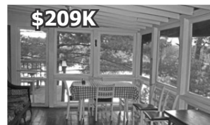
730 Bear Trap Lane