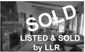
832 138th Street