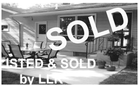
1287 So. Shore Dr.