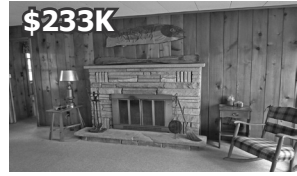
736 So. Shore Drive