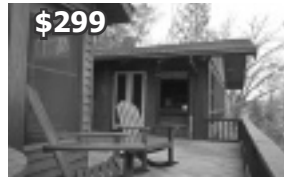
667 Bear Trap Court