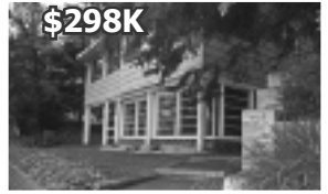
739 Cty. Rd. C