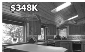
677 Bear Trap Court