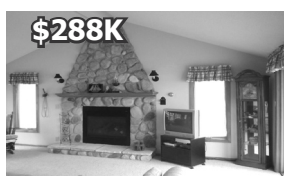
772 So. Shore Drive