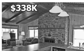
898 Sunrise Beach Dr.

and I'll set up an auto-email account for you ... info direct from our MLS (multiple listing service)