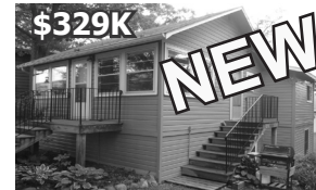
820 Wapo Lake Lane