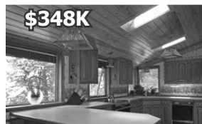
677 Bear Trap Court