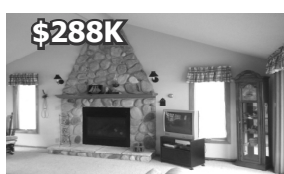
772 So. Shore Drive