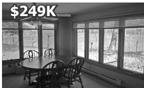
986 Sunrise Beach Dr.