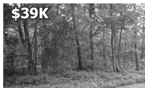
73X Bear Trap Lane