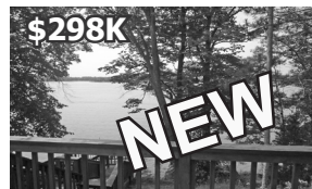
723 Hickory Pt Ln