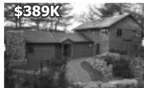
997 Lone Pine Court