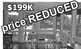
730 Bear Trap Lane