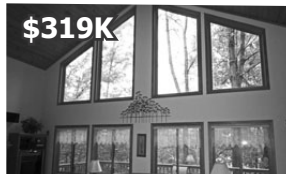
1006 Sunrise Beach Dr.