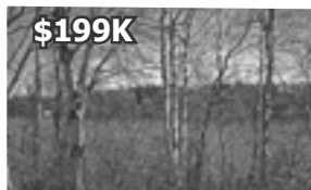
672 So. Shore Drive