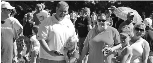
Turtle Races are a favorite for ALL ages