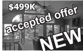
793 Hickory Point Ln