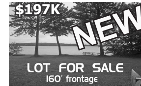
832 138th St.

KEEP INFORMED of "WHAT'S HAPPENING" on WBT