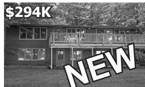
759 County Rd. C (115th)