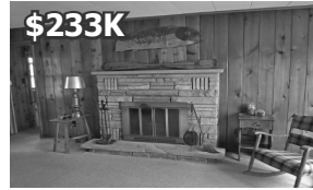
736 So. Shore Drive