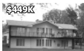
717 Cty. Rd. C