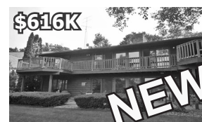
1161 Jeans Lane