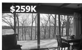
806 Flo's Court