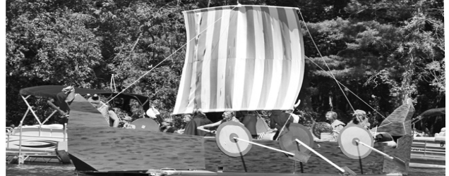
The Zwakman/Gill family VIKING ship took 1st place