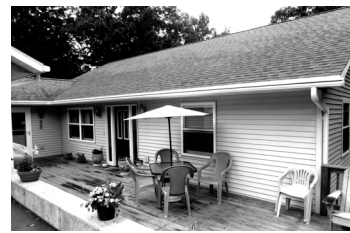
669 Bear Trap Court