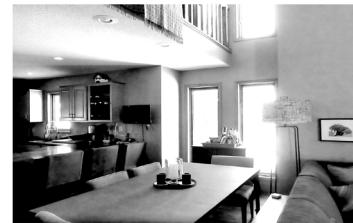
982 Sunrise Beach Drive