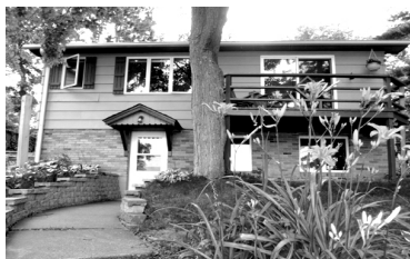
721 Hickory Point Lane