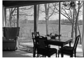
806 Flo's Court