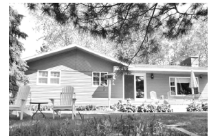
718 Bear Trap Lane