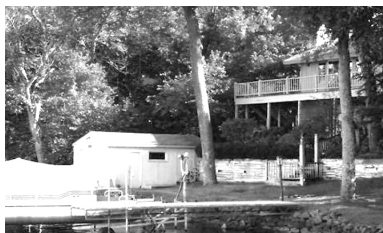
1283 South Shore Ct.