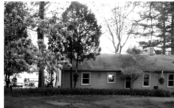
738 South Shore Drive